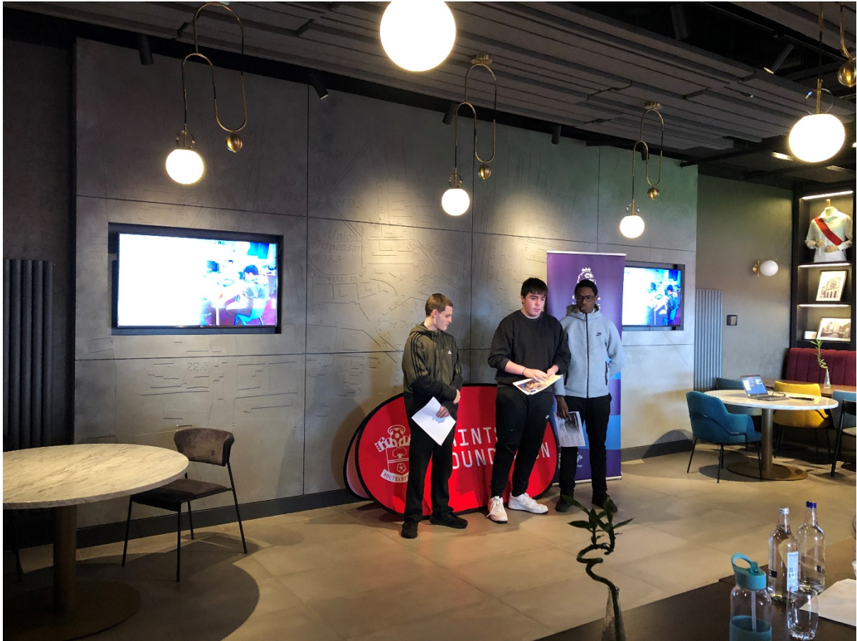
Saints Foundation Event February 2024 – KS4 pupils

At Compass School we offer a range of enrichment activities and cultural capital initiatives which deliver a positive impact on our pupils. The aim of these programmes is to expose our pupils to a rich array of experiences, fostering personal growth and enhancing their overall education. By participating in enrichment activities our pupils can develop a deeper understanding and appreciation of the world around them, exposure to diverse cultural activities promotes tolerance, empathy, and a sense of belonging, creating a more inclusive and supportive learning environment within our school.